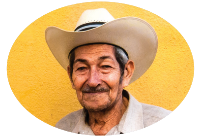
ON THE COVER Design: Wendy Barnes